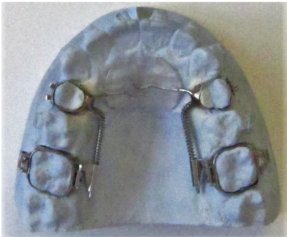
Distaljet appliance with palatal support via acrylic pads

The Distaljet comes with a support in the palate area that incorporates an acrylic pad. In adults, support usually is provided by a mini-implant in the palate area. By way of exception, such a mini-implant can also be used in children and adolescents.